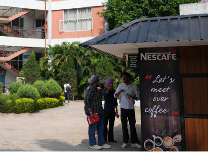
A favourite go-to spot for students with an extensive food and drinks menu