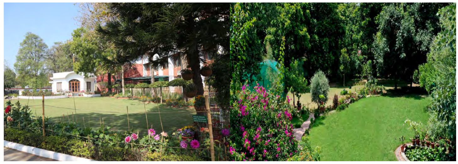
Barah Maha Garden of Biodiversity

The Hostel is in the vicinity of Guru Nanak Sacred Forest: Mini Urban Forest with Native Species and Balihari Kudrat Biodiversity Park that provide calm surroundings and clean air as compared to the Chandigarh region. Hostel residents have access to the lush green lawns on Campus round the clock.