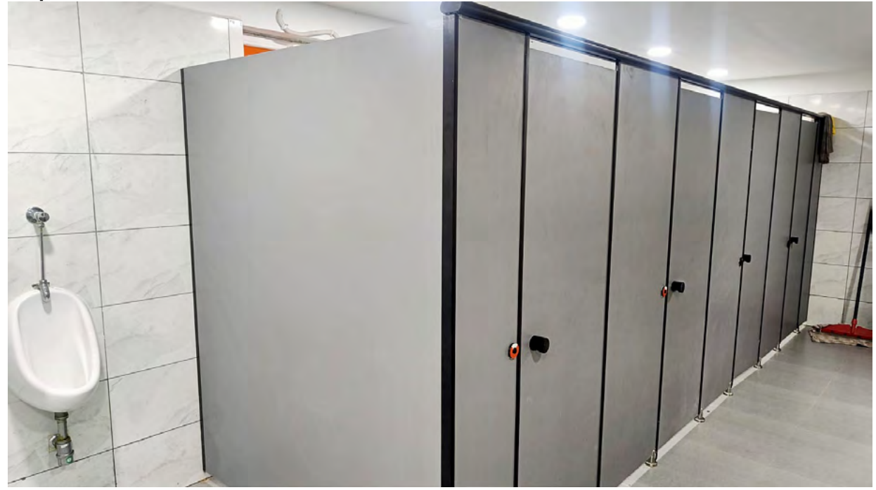
Newly Renovated Hostel Washrooms Equipped with Modern Amenities

Baba Banda Singh Bahadur Boys' Hostel has 24 AC Rooms and other non-AC Rooms. AC rooms are provided to hostellers at an additional charge. Each room is well-ventilated with connected balconies and furnished with bed (without linens), a study table, a chair, and a cupboard