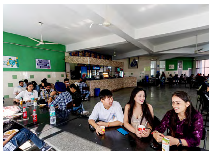
A lively place for students that creates a warm and welcoming atomsphere